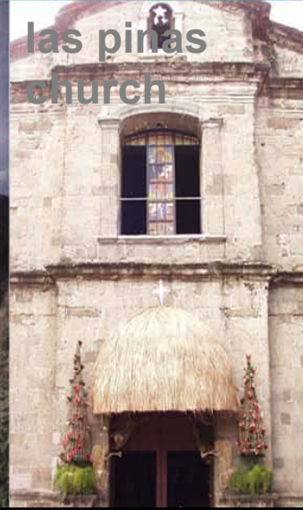
las piñas church